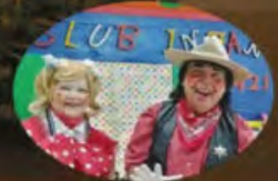
Dño Preludio Club Infantil

Niños de 7 a 14 años gratis con inscripción