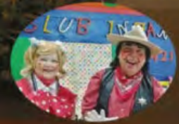
Dúo Preludio Club Infantil